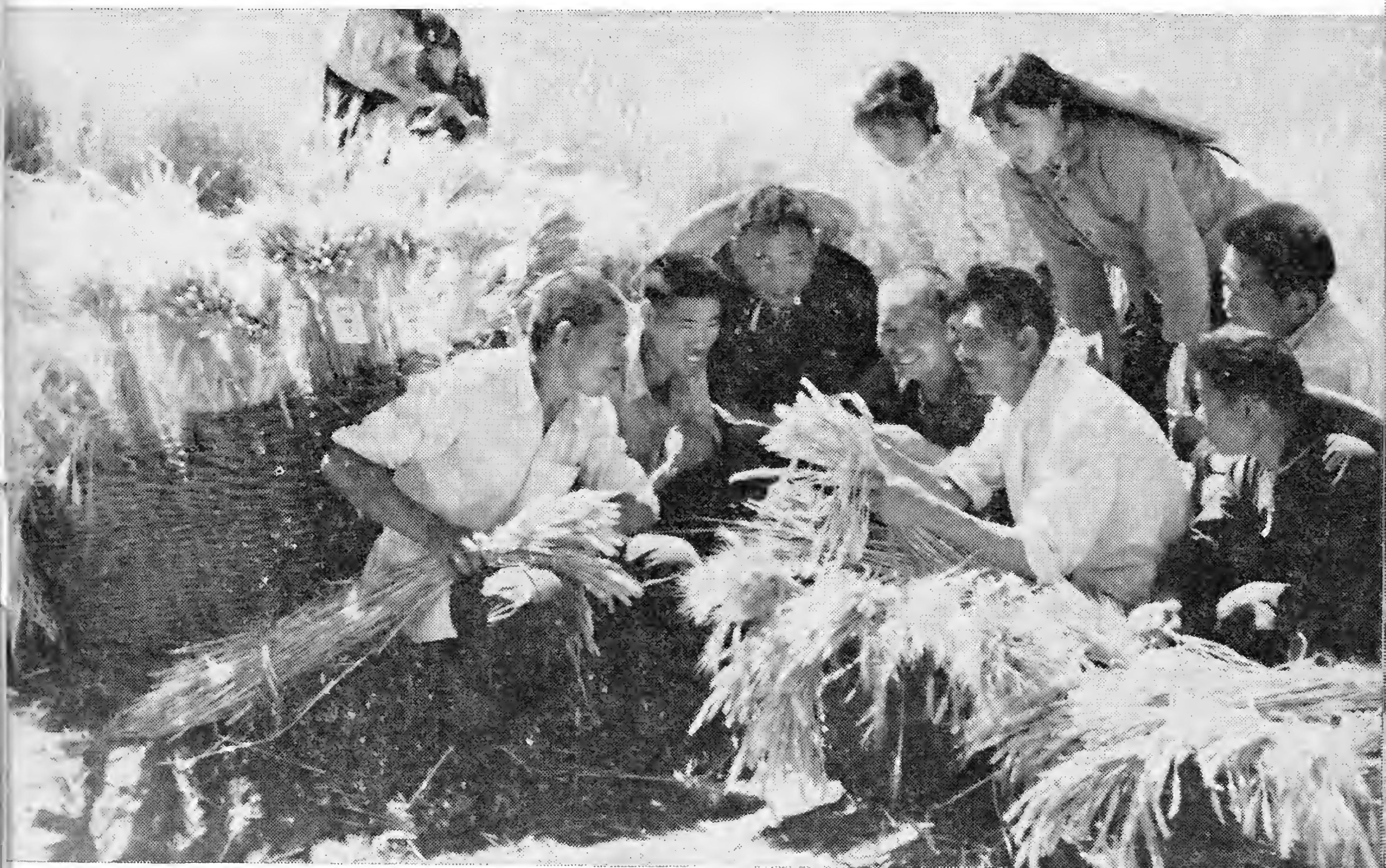
Cadres, veteran peasants and technicians select seeds together in a newly harvested wheat field of the Nanchungchia brigade in Shantung province.